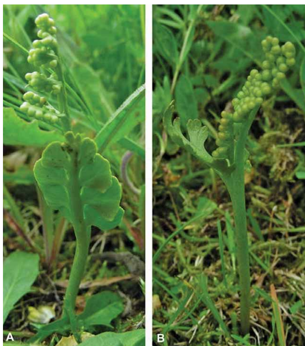
Fig. 2. The image of Botrychium lunaria (A) and Botrychium matricariifolium (B).